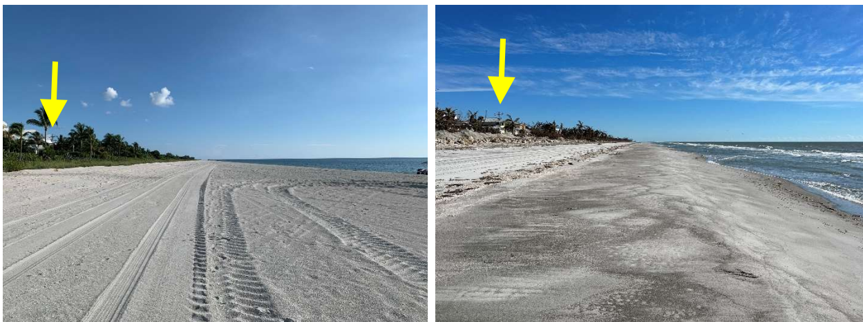
Figure 4: Pre-storm and post-storm conditions near Jensen's Curve looking south to Tween Waters (Note: the yellow arrow denotes the same utility pole in both photos)

As Captiva Island is a locally constructed engineered beach, it is eligible for federal assistance under Federal Emergency Management Agency (FEMA) Category G funding to repair the beach. It is recommended that a post-storm beach profile survey be conducted to determine the volume changes on the beach. These changes due to Hurricane Ian can then be provided to FEMA in order to develop the Project Worksheet (PW), which could result in funding for an emergency restoration project to replace storm losses.