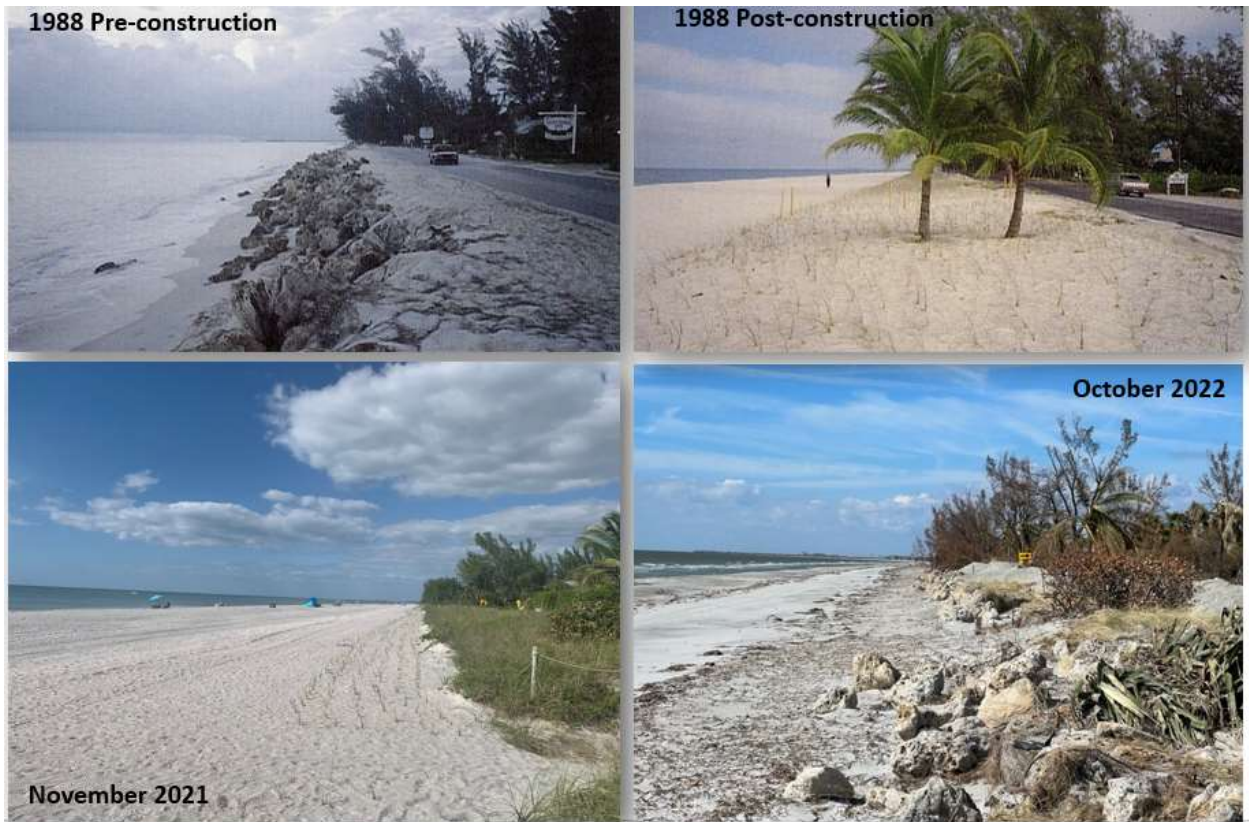
Figure 3: Historic, pre-storm, and post-storm conditions near Jensen's Curve